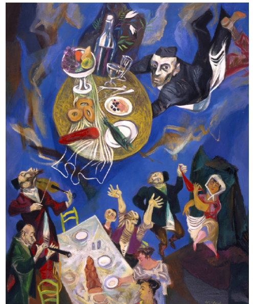
WILLIAM GROPPER Plate from Heaven , 1963 Oil on canvas 50 x 40" Gift of Sophie Gropper

The Museum of Art moved to Bangor in December 2002 and embarked on an active exhibition program that focused on photography. Included in the exhibition are works by Manuel Alvarez Bravo and George Tice which were acquired after their solo exhibitions. Since its relocation, the museum has programmed exhibitions that highlight artists who work in Maine.