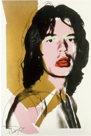
JONATHAN BAILEY Iceberg #14, Twillingate, Newfoundland , 2004 Gold toned gelatin silver print 19 1/4 x 19 1/4" Gift of the artist